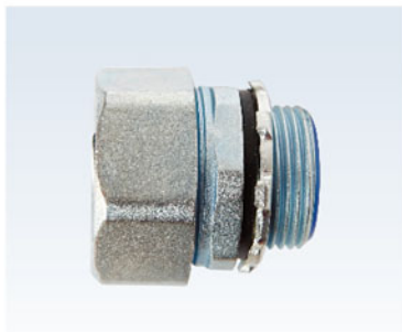
TYPE ZGSM (外螺紋接頭)