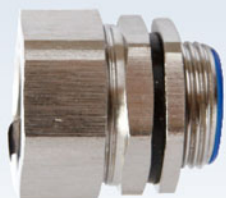
TYPE SSM-A (外螺紋接頭)