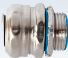
TYPE SSM-B (外螺紋接頭)